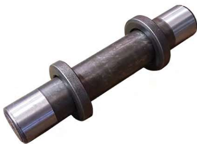
Press fit Master Pin