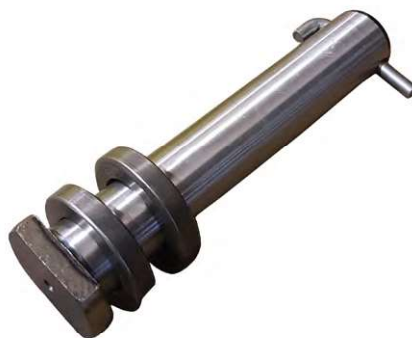
T-type Master Pin