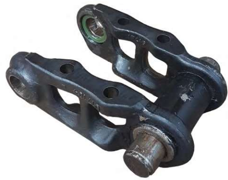
Excavator Link Kit